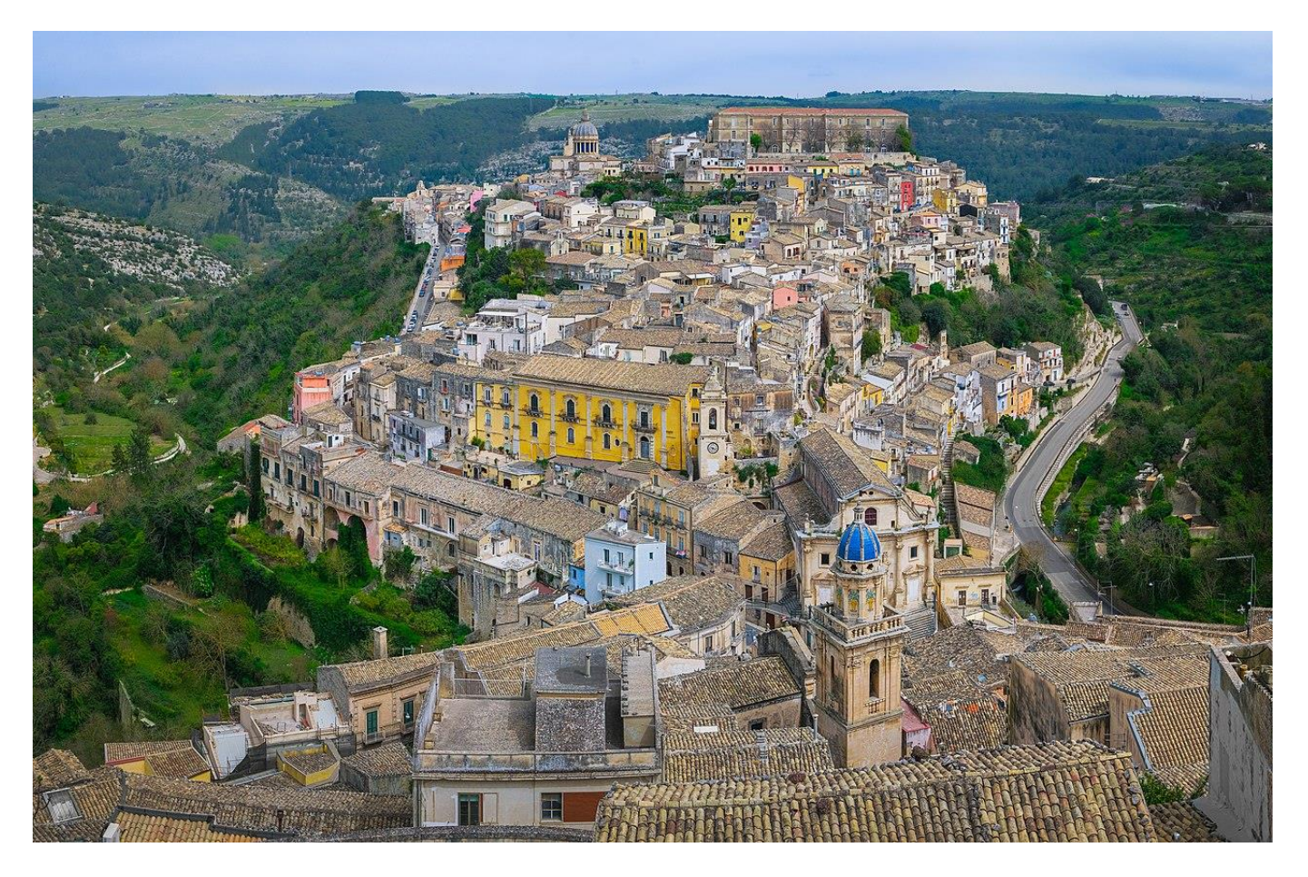
More photos can be seen of Ragusa if you are digitally reading this newsletter. Just click here >>> <u>Ragusa Ibla, Sicily - Ragusa, Sicily - Wikipedia</u>

More of the history of Ragusa can be read by clicking here >>> <u>Ragusa, Sicily - Wikipedia</u>