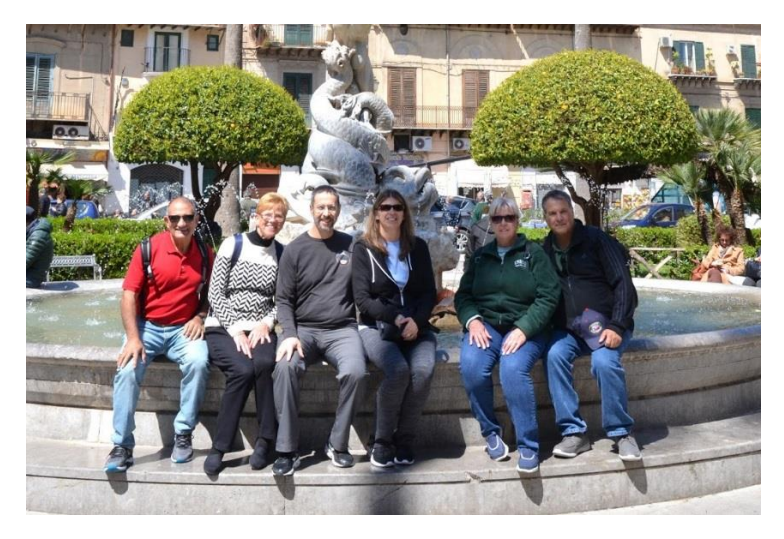
The above photo was taken in a piazza in Monreale Sicily, just outside of the Cathedral of Monreale