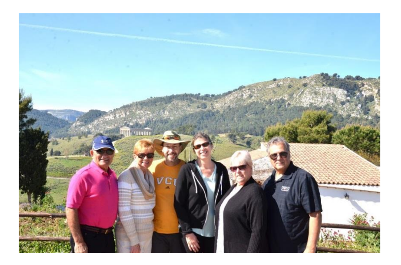
The above photo was taken in Trapani with a Greek Temple in the background