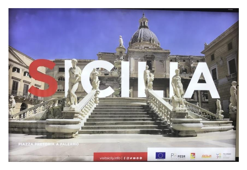
The above photo was taken of a poster in the Palermo Airport welcoming us to Sicilia